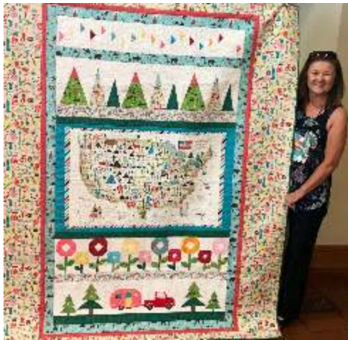
Odette Osantowski with "Road Trip, 2017"